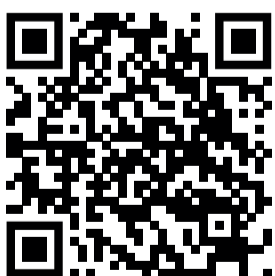
Video: "Klimatea and climate change".

Monday Tuesday Wednesday Thursday Friday Saturday Sunday