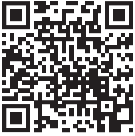
Video: "Saving energy at home".

Monday Tuesday Wednesday Thursday Friday Saturday Sunday