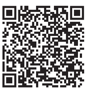
Video: "Sustainable World".