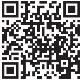
Video: "Car, bus, plane, train... What pollutes more?"

Monday Tuesday Wednesday Thursday Friday Saturday Sunday