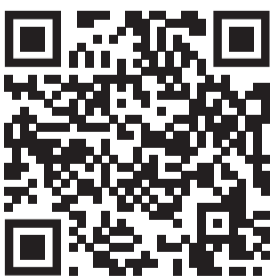
Video: "What do kids know about climate change?"

Monday Tuesday Wednesday Thursday Friday Saturday Sunday